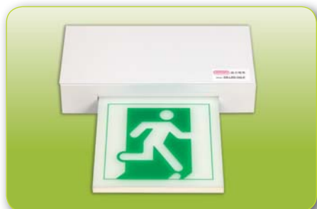
"CRYSTALITE" Cat. CX-LED-165-P