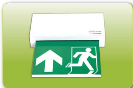
"CRYSTALITE" Cat. CX-LED-220-P